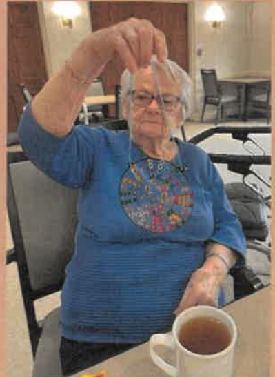
Beautiful suncathcher craft!