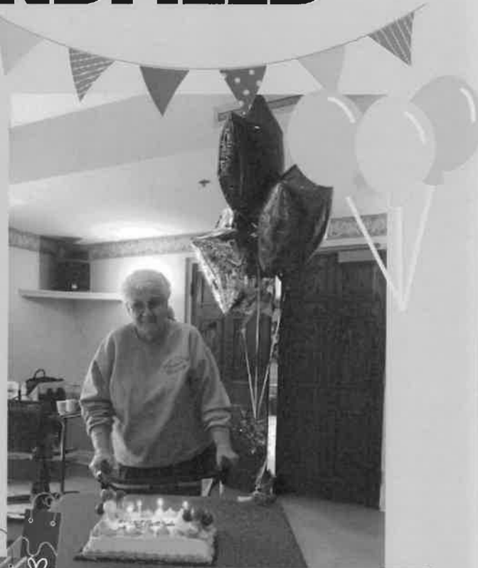
HAPPY BIRTHDAY APRIL!