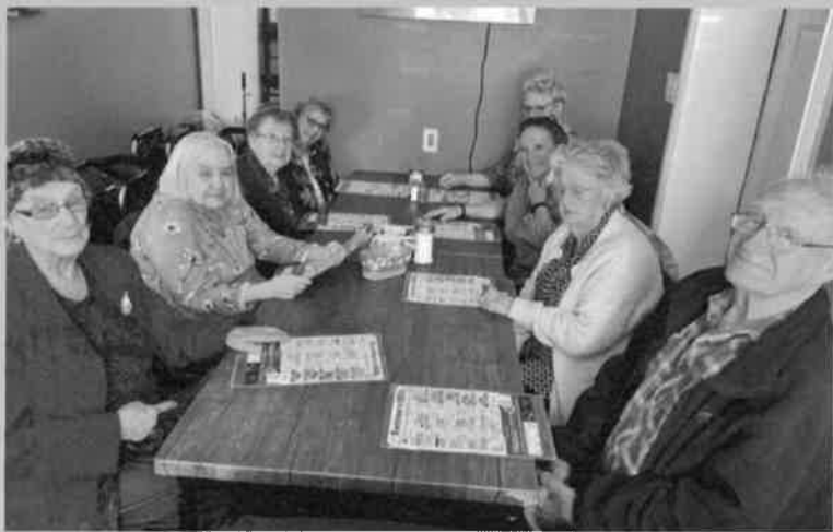
OUT FOR LUNCH