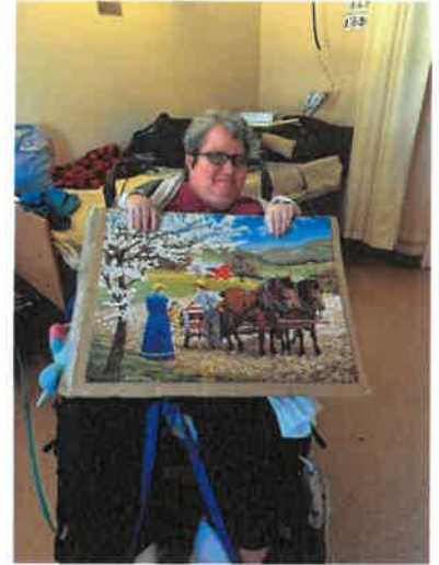
KAREN'S LATEST PUZZLE