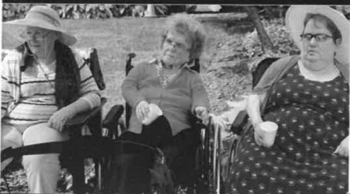
WAITING FOR THEIR HORSE TO WIN