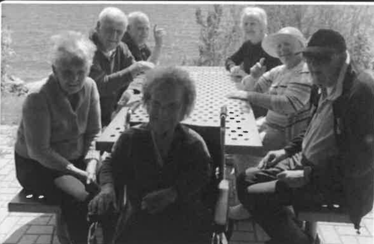
LTC Picnic to Morrisburg